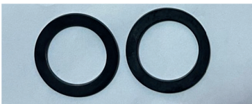
Pump Union Gasket